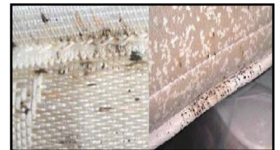
Blood stains and fecal spots on a mattress

Live bed bugs, eggs and cast skins indicate a bed bug infestation. Small black or rusty colored spots found on bed linens, pillows, or the mattress may be blood spots and bed bug droppings.