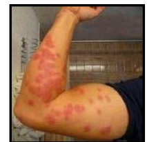
Welts from bed bug bites