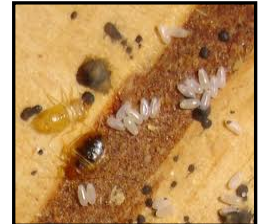
Bed bug eggs and cast skins