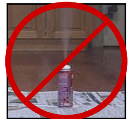
Do not use foggers