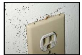
Fecal spots by outlet cover